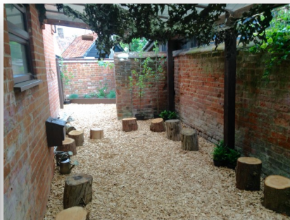
Otter Class garden